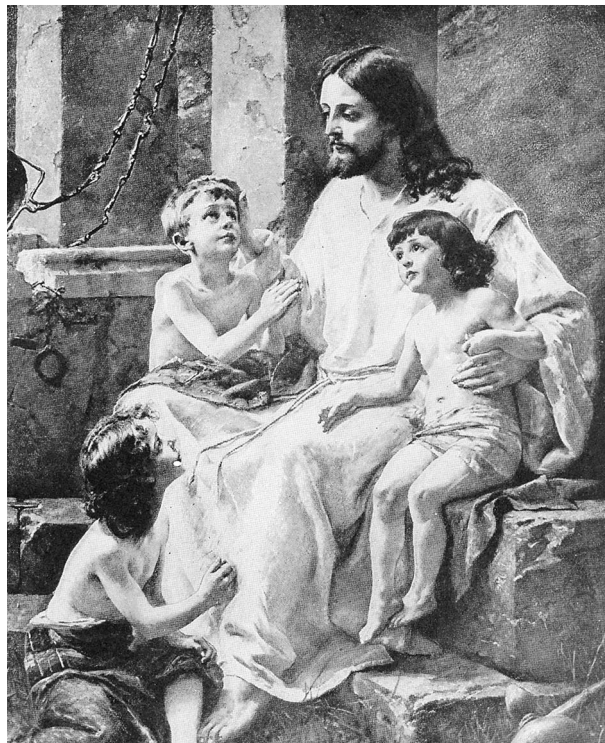
Let the little children to come unto me, late 19th century print

upon the marital consent of the spouses, and the children they bring into the world or adopt. Marriage exists for the good of the spouses and for the procreation and education of the children with which God blesses them. The education and nurturing of their children is the right, responsibility, and privilege of parents. With this wonderful privilege comes accountability to God for its responsible fulfillment.