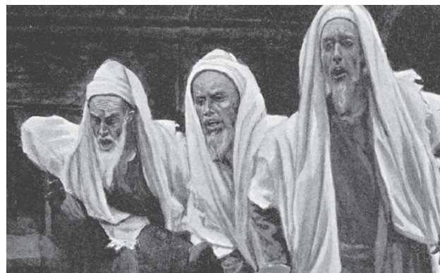
The Pharisees accusing Jesus, by James Tissot, 1856-1902

“The seven deadly sins are perverse inclinations that cloud our consciences and distract our judgment of what is good and what is evil.”